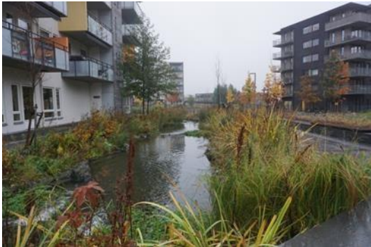
The Hovinbekken river flowing through a town, now partly reopened

As Green Capital of Europe 2019, Oslo played host to the Environment Forum at the end of October 2019, which this year addressed the big topic of global plastic pollution. Sarah Arnold, climate protection officer, represented Chemnitz alongside over 120 participants from some 80 cities. According to WWF, one truckload of plastic garbage is dumped into our seas every minute. 80 % of the world's plastic waste remains in the natural environment, and makes its way up the food chain. WWF has found that we consume roughly a credit card-sized amount of plastic every week, and has partnered up with Eurocities to launch the global Plastic Smart Cities initiative, which calls on cities to take action. Plastic pollution is a global problem, and the solution starts at home, at municipal level. 55 % of the world's population lives in cities; by 2030 this figure is set to reach 70 %.