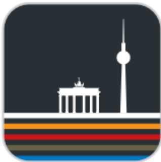
App brings Berlin's history to life

There were first-hand updates on the formation of the new EU Parliament and EU Commission. Ursula von der Leyen begins her term of office as the new President of the EU Commission in 2020; her goal is to make Europe the first climate-neutral continent in the world by 2050. The plan will be underpinned by a series of measures under the European Green Deal. The EUROCITIES working group on air quality, climate change and energy efficiency looked at the impact of tyre wear on air quality, and discussed how to encourage more industry players to join the energy revolution. An excursion to the Hovinbekken river showed how restoring a river can bring back quality of life and biodiversity to an area.