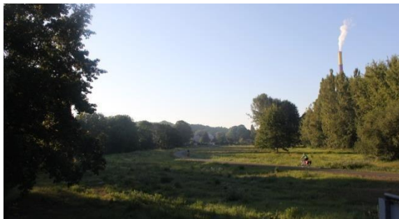
Chemnitztal Cycle Path at Glösa – cycling in idyllic scenery