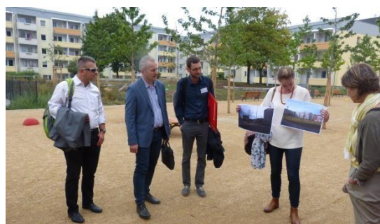
Tour of the Sonnenberg district and presentation of success stories and new developments