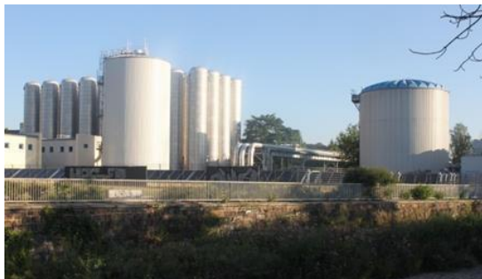
Energy firm eins heat and cold storage facilities in LowEx district heating network in Brühl

The European Energy Award®, or eea® for short, is a European programme that assesses local municipalities' efforts and achievements across climate protection in six key areas. Chemnitz has been involved in the eea® process since 2010, scooping the Silver European Energy Award® in 2011 and 2014. In 2015, Chemnitz, along with Delitzsch, became the first local authority in Saxony to achieve the GOLD award, scoring 77.5 points out of a possible 100. An independent, external audit in June this year scored Chemnitz at 82.7 %, demonstrating a considerable improvement since its first Gold certification in 2015, despite more rigorous conditions.