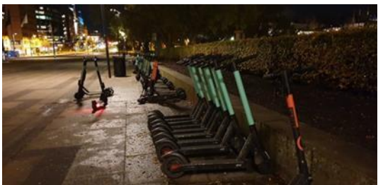
E-scooter hire station to help residents get around the city

There were first-hand updates on the formation of the new EU Parliament and EU Commission. Ursula von der Leyen begins her term of office as the new President of the EU Commission in 2020; her goal is to make Europe the first climate-neutral continent in the world by 2050. The plan will be underpinned by a series of measures under the European Green Deal. The EUROCITIES working group on air quality, climate change and energy efficiency looked at the impact of tyre wear on air quality, and discussed how to encourage more industry players to join the energy revolution. An excursion to the Hovinbekken river showed how restoring a river can bring back quality of life and biodiversity to an area.