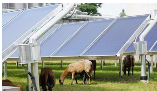
Solar energy system owned by eins, with twice the green power usage

Interdisciplinary collaboration between local authorities and municipal companies is absolutely vital for the success of Saxony's climate protection efforts. The driving force for this from the outset has been the energy team. Current projects include: the implementation of higher energy standards and renewable energies in districts being redeveloped as part of the city's urban development plans; the Chemnitzer Modell tram-train system; the PV roof at the daycare centre on Walter-Ranft-Strasse; the heating concept delivered by energy company eins; the supply of sustainably sourced wood chips from local landscapes to outdoor play areas in kindergartens and schools; and civic participation in Environment Centre groups.