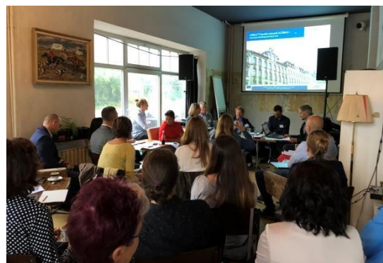
First meeting of partner cities in the ALT/BAU network, September 2018

In early December, the EU Office will host a guided tour of the Town hall for academics and students from Łódź Technical University and the University of Ljubljana. They have been invited by the Saxon Textile Research Institute Chemnitz (STFI) as part of the RESTED project being run by the Federal Ministry of Education and Research. In collaboration with partner cities Łódź and Ljubljana, the STFI is developing new approaches to responsible research and innovation within textile training. The idea is to develop an EU project that puts textile recycling, and sustainable design for innovative product development and eco-balance, at the forefront of teaching.