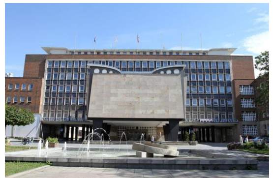
Representatives from Ústí nad Labem city council joined in the discussion

On 3 and 4 April, Chemnitz association Die Brücke e. V. hosted a symposium to discuss the future of the city's partnership with Ústí nad Labem. Representatives from various cultural institutions in both cities came along to share project ideas and suggestions for future events. The aim is to get citizens more involved and to inject more life into the partnership. Speakers delivered talks on project funding and Chemnitz's application to become a European Capital of Culture in 2025.