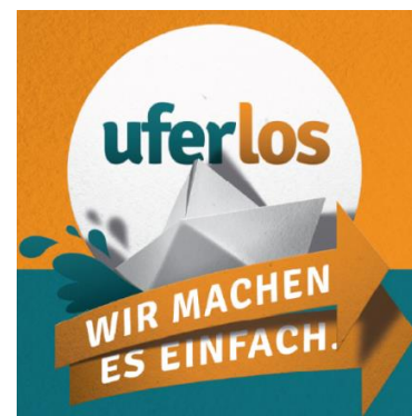
Uferlos is a project of AGJF Sachsen e. V.

"Young people who have not yet seen the world are by no means lacking motivation; it's just that they haven't been able to make it a reality..." By launching a number of suitable measures, Uferlos ("Boundless"), the Office for International Youth Work in the Free State of Saxony, supports young people with a state-wide network of specialist services. In addition to lobbying for international youth work, Uferlos offers process-oriented advice on topics such as youth meetings and professional exchange programmes; it also liaises with national and international partners and works with them to plan training courses. Up-to-date information is available online at uferlos.agjf-sachsen.de . Uferlos is funded by the Saxon State Ministry for Social Affairs and Consumer Protection.