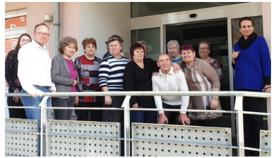
Senior groups welcoming their Czech friends in the Heckert area of Chemnitz

Friendships blossomed after a chance encounter between two senior citizen clubs from Louny and Chemnitz (Bürgertreff "bei Heckerts" social club). In the summer of 2018, a group of senior citizens from living communities in Chemnitz's Heckert neighbourhood went to a village festival in the Erzgebirge region, where they happened to bump into members of a senior citizens' club from the town of Louny in the Czech Republic. Despite the initial language barrier, the two groups stayed in touch and further get-togethers were planned. After making the trip to Louny for International Day of Older Persons on 1 October 2018, the Chemnitz residents welcomed their new Czech friends for coffee and cake at a Women's Day event and showed them around a few of the living communities run by the local Volkssolidarität association. A number of other joint projects are planned for the rest of the year, including a steamboat trip in Louny and a visit to the district festival in Heckert.