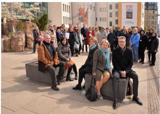
The fourth study visit was devoted to “Art, Culture and Education”

The international forum delegates took an in-depth look at the work of various cultural institutions in Chemnitz, gathering plenty of ideas and impressions to take home with them from their visits. Museums such as the Natural History Museum, the Art Collections and the Railway Museum, as well as smaller cultural associations including Kreatives Chemnitz e. V., DELPHIN-Projekte gGmbH and KOMPLEX, were also represented at the event. At the final session on Friday, the best practices presented during the visits were praised as highly inspiring. European guests were particularly impressed by Chemnitz’s industrial culture, cross-generational work and the development potential that the free space in the city offers. There was even talk of the “luxury of emptiness”.