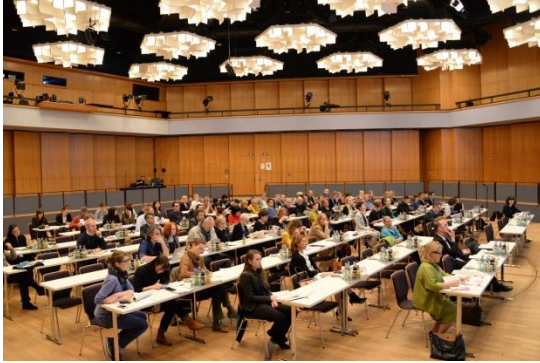
The EUROCITIES Culture Forum held a conference at the Cultural and Congress Centre

The EUROCITIES Culture Forum offers those working in municipal cultural policy the chance to share experiences with other cities and to gain insights into the cultural life of their host city. From 10 to 13 April, Chemnitz welcomed around 115 members of the EUROCITIES Culture Forum from 57 European cities. Delegates came together to discuss “Municipal development and support from local cultural organisational networks” in order to highlight the importance of municipal collaboration in European cultural policy and to shape it in a way that is both sustainable and citizen-centred. The springboard for the forum this time was the development of a new cultural strategy for Chemnitz – involving cultural stakeholders and interest groups active in the field of cultural urban development.